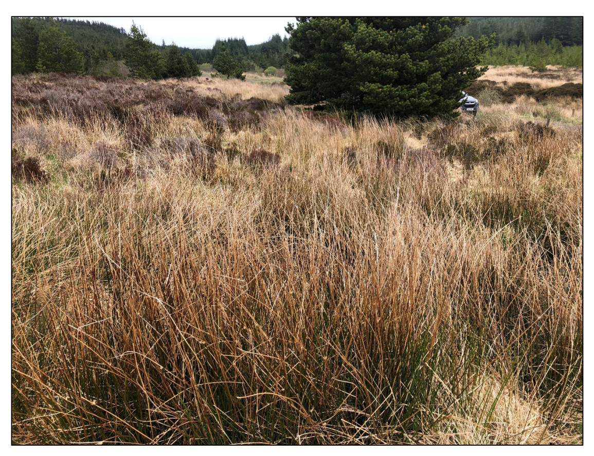
Plate 2-4 Coillte Biodiversity Area located to the east of T12, and west of T15