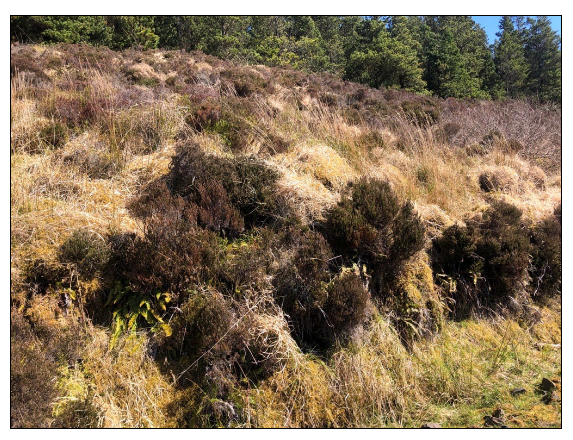
Plate 2-2 Habitat type at the proposed Borrow pit located to the south of T20, and southwest of T19.