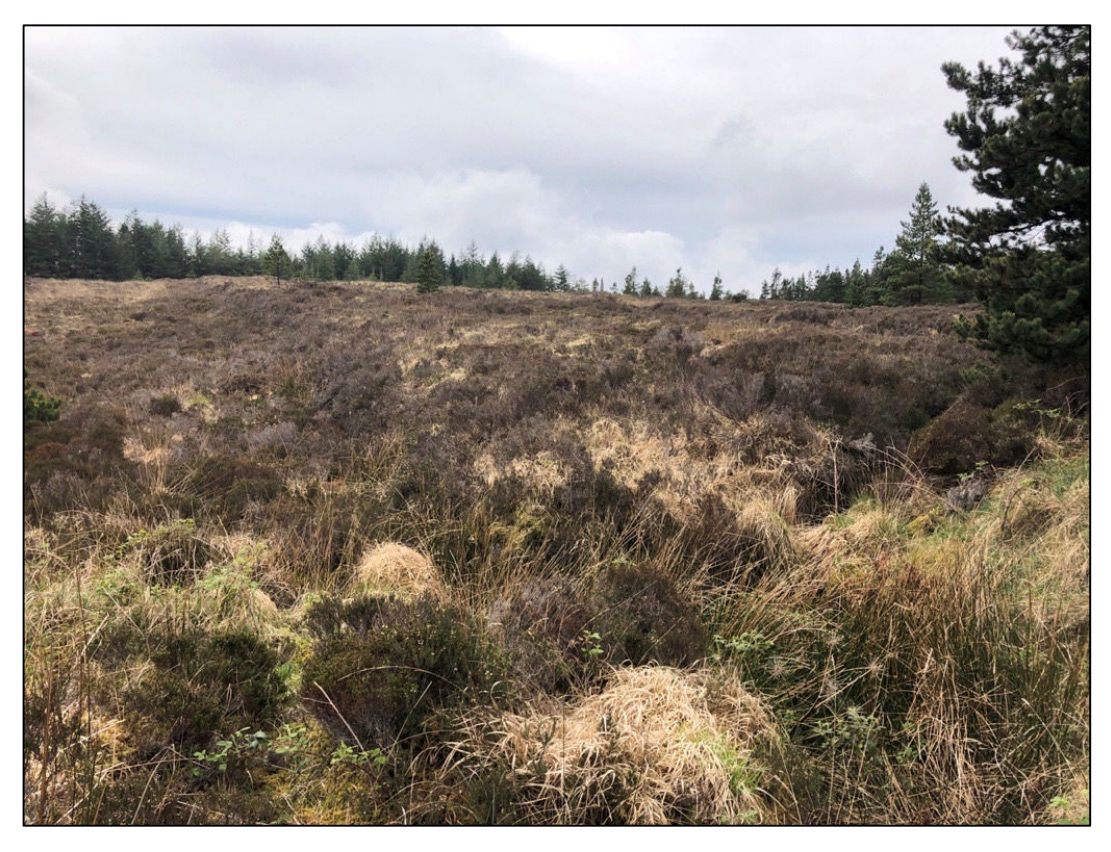
Plate 2-1 Habitat type at the proposed Borrow pit located along the grid connection route.