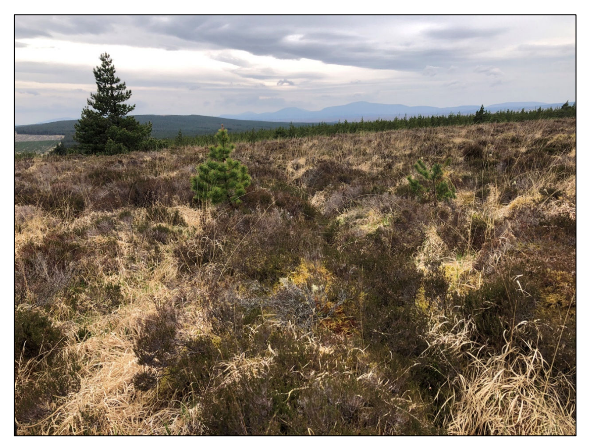
Plate 2-3 Coillte Biodiversity Area west of T11.