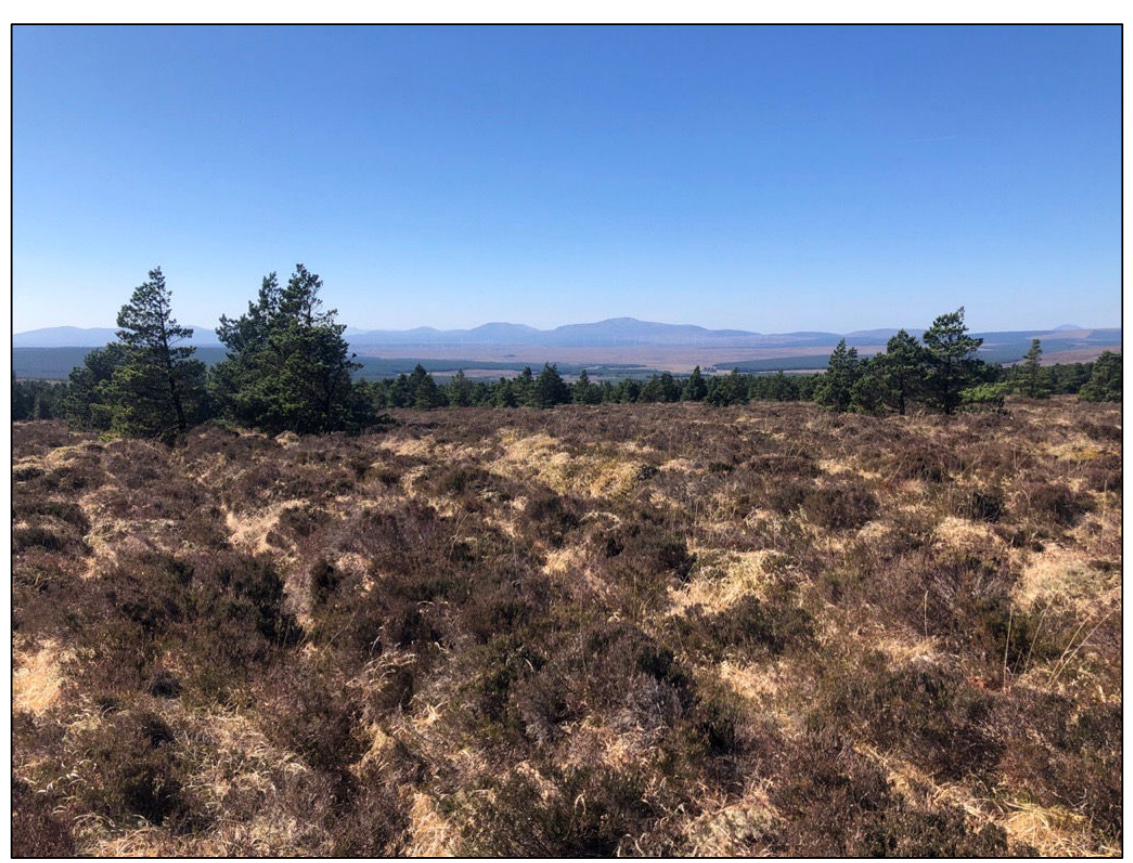
Plate 2-5 Biodiversity Management Enhancement Plan (BMEP) Area located to the northern margin of the development site.